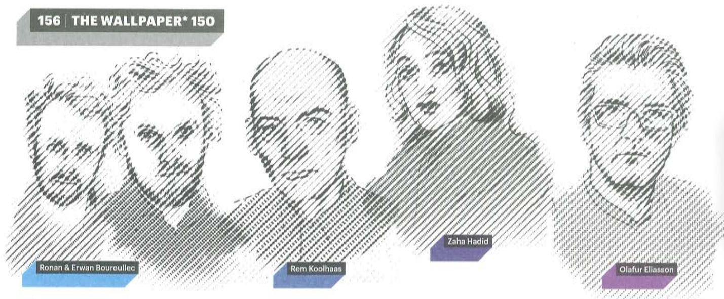
Ronan &amp; Erwan Bouroullec